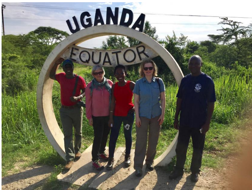
Photo: Representatives of UNU-LRT and the Ugandan partners